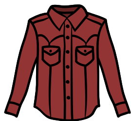
MEN'S WESTERN SHIRTS

Both traditional and modern clothing donations are appreciated and we can always use more men's clothing.